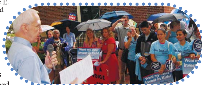
"Step Up for Kids" rally at Capitol Square.

The fiscal year for Voices for Virginia's Children was from January 1, 2007 through December 31, 2007. This 2007 Annual Report is produced to record all grants and gifts received in this fiscal year. Every effort has been made to ensure accuracy of these listings. If you were a contributor and your name was omitted, listed incorrectly, or misspelled, please notify Voices. Thank you.